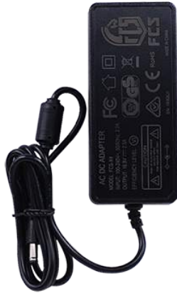
● Power supply