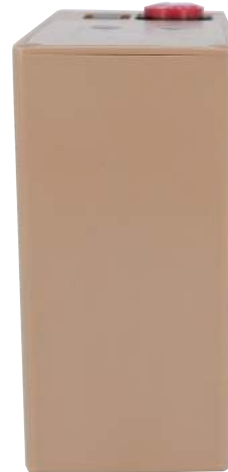
● Left view