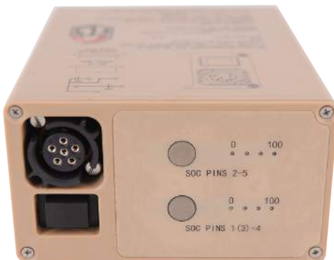
● Top view

* The data in this document is subject to change without notice. *