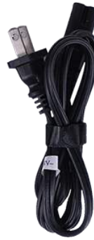
● Power cord